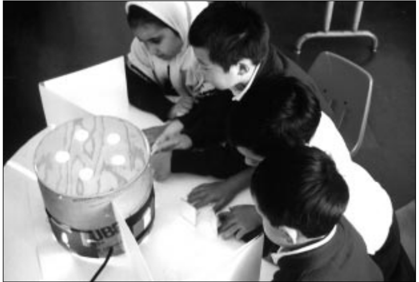
Working with the Round Light Source

Once the children are comfortable using their mirrors, I give them new tools to use, such as prisms. Prisms allow the children to explore what happens when light is bent. It's a magical event when we learn how to make rainbows!