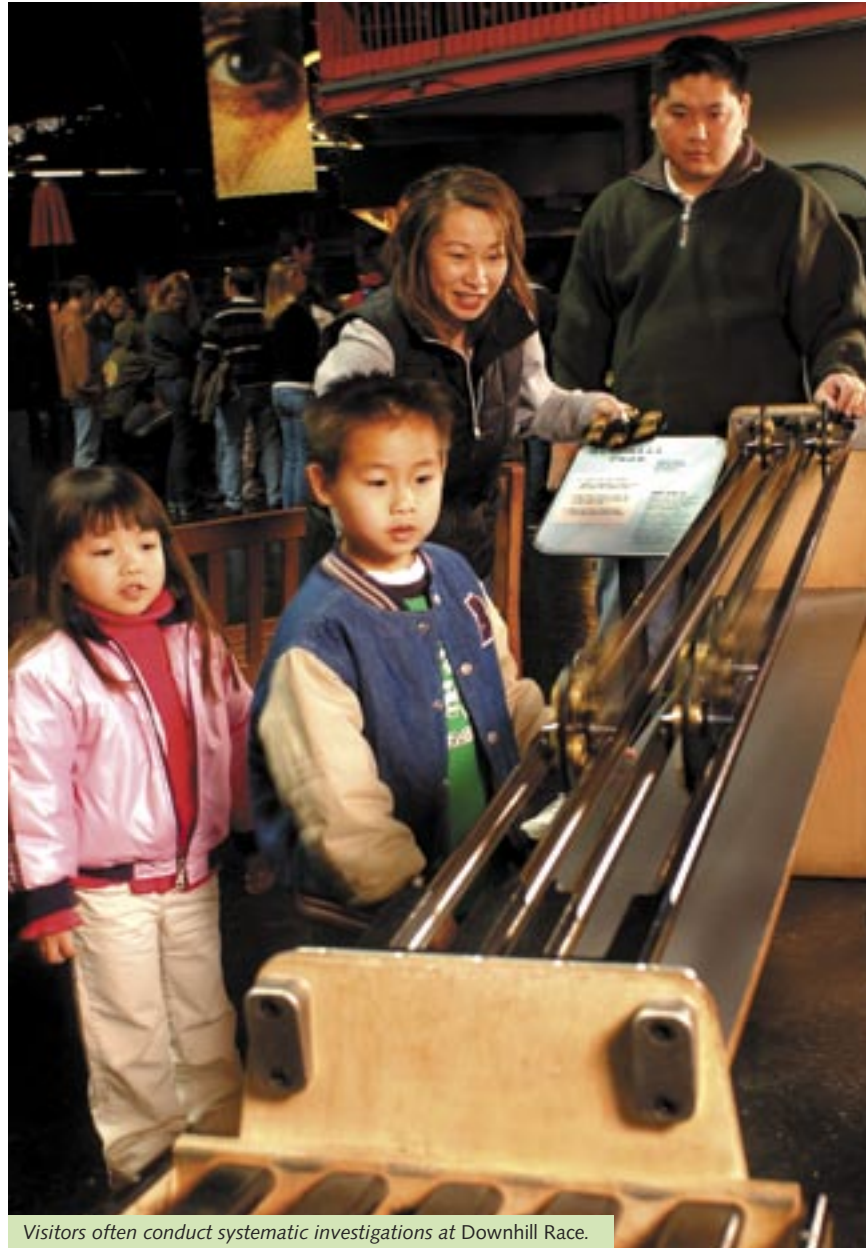
Visitors often conduct systematic investigations at Downhill Race.

that rolled down on their rims. This exhibit eventually wore out and was later destroyed in storage, so I opted to rebuild it in the current form with wheels designed to roll on their axles.