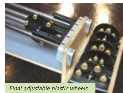
Final adjustable plastic wheels

However, many APE team members were concerned that the wheels were overly confusing to visitors. Specifically, several felt it was unfair to introduce the question of air resistance because visitors could not directly test it (and rule it out as a primary factor) with the wheels I originally provided. So I built another set of four wheels, primarily as an evaluation tool. These new wheels were not durable enough to leave on the floor; they were made of plywood with cylindrical brass weights pressed into them. They were of