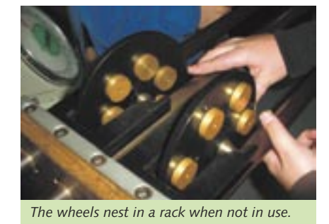
The wheels nest in a rack when not in use.

We tested different graphic treatments at the exhibit because we thought the explanation might have a strong effect on visitors' investigations. Did visitors need the explanation we offered them? Even if they figured out what was happening on their own, would they still want an explanation as a confirmation of their thinking? Would they feel frustrated if we did not offer them an explanation? To answer these questions, we tested three versions of the graphic. The first was a traditional Exploratorium version, which provided suggestions for how to use the exhibit ("Try this") and an explanation of the phenomenon ("What's going on?"). The second version offered only suggestions ("Try this") without an explanation. The