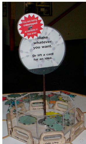
Figure 3. Sign at exhibit.

Table 1 compares features of the original and new methods for posting signs to gain visitor consent. Figure 4 shows the entire set-up used in the new method.