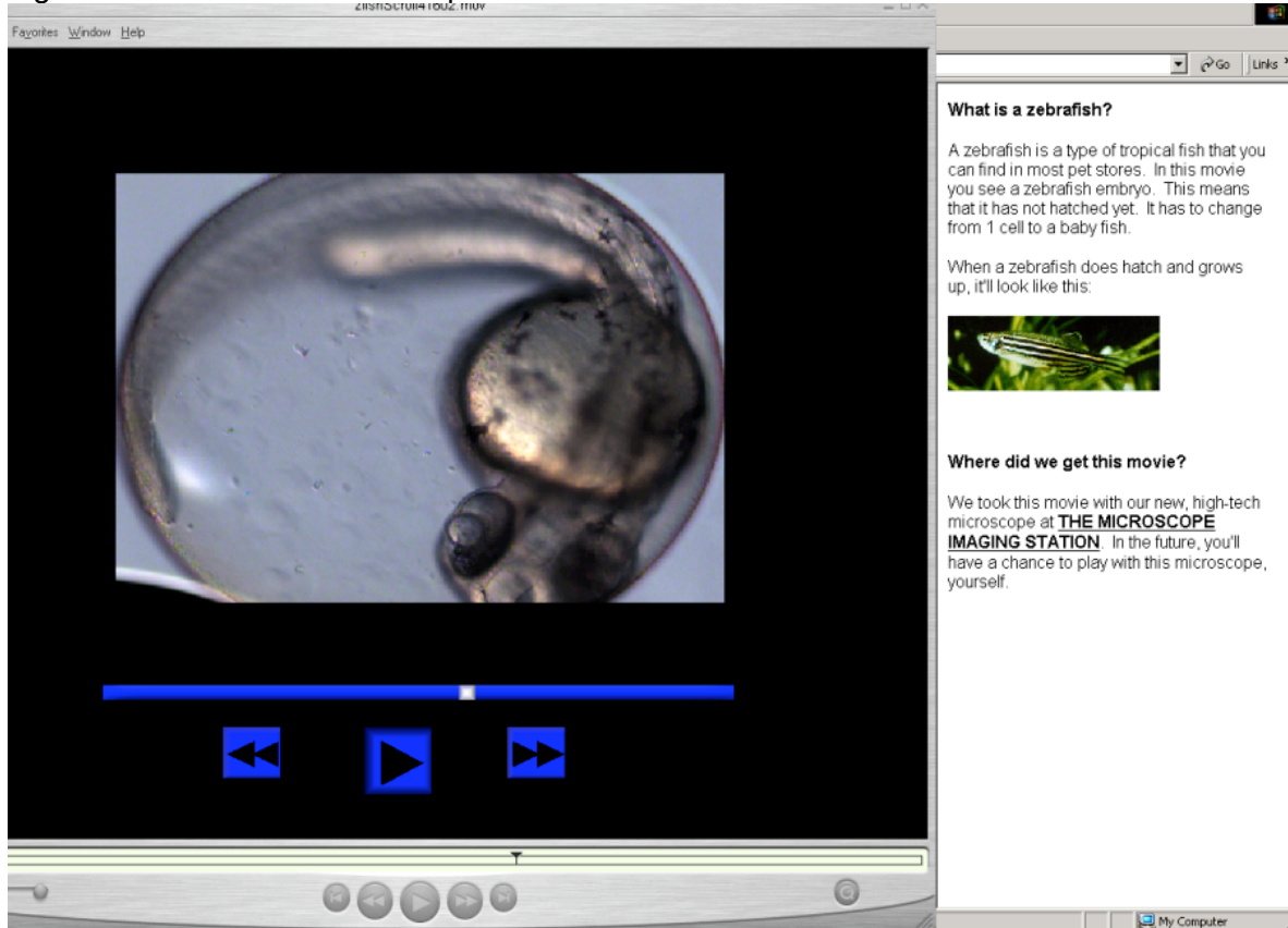
Figure-1. Screenshot of time-lapse video shown.