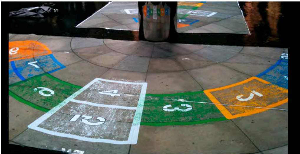
U-shaped Hopscotch (curved)