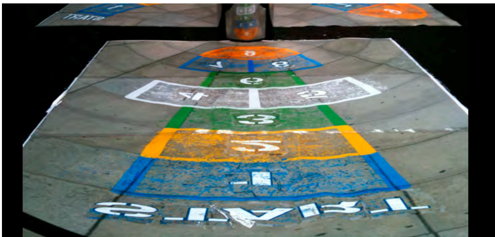
I-shaped Hopscotch (straight)